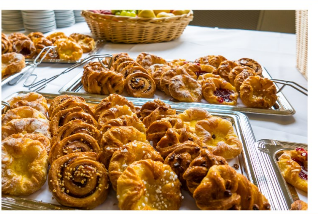
Held @4:30 @ the Extension Office