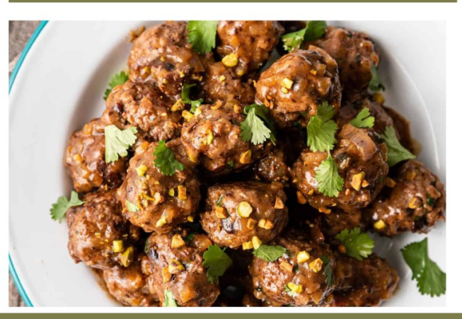
Held @3:30 @ the Extension Office

For more information and to receive the first month's challenge email:wilcenski@wisc.edu by Oct 31st with the Subject- 4-H Cook Off