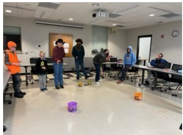
Fun at the Jr. Leaders Halloween Party!